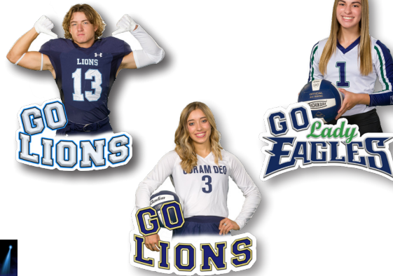
Team Spirit Big Heads